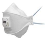
3M™ Aura™ Health Care Particulate Respirator 1872V+