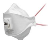
3M™ Aura™ Health Care Particulate Respirator 1873V+